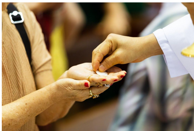
Holy communion received within the celebration of Eucharist.

I am not sure when it started creeping into everyday usage, but there is a phrase that drives me crazy when it comes to Catholic liturgy.